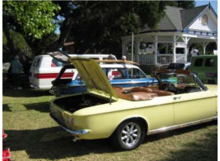
A Beautiful '64 Spyder with custom fuel injection