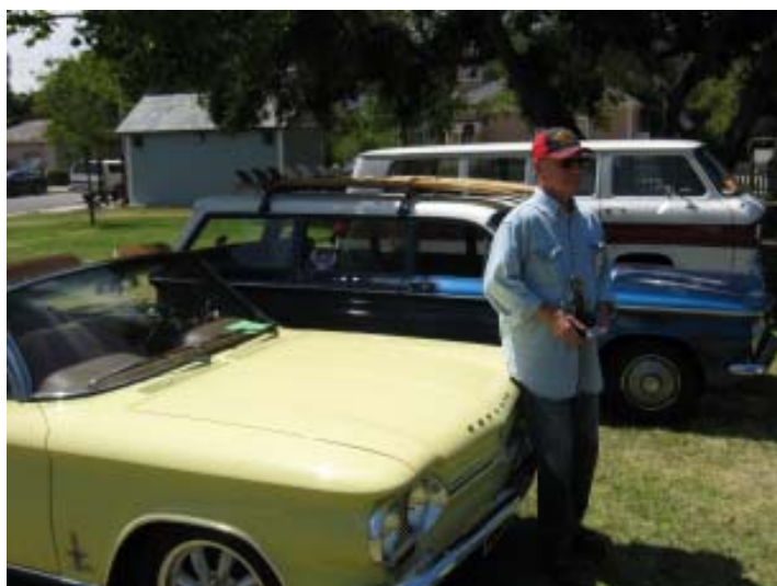
The '64 Spyder convertible won its class.