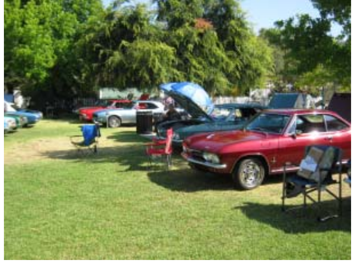
More Late Models