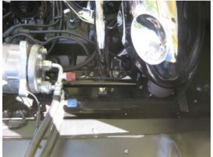
Another shot of the injectors. Looks factory made!