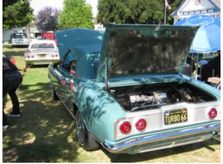
Pretty '66 180 hp Corsa Turbo Coupe