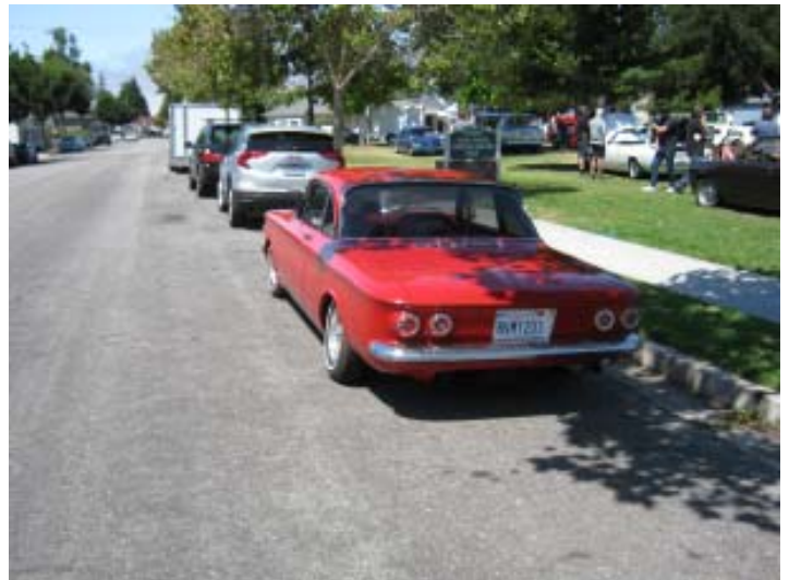
A very nice Early ('63?) that stopped by.