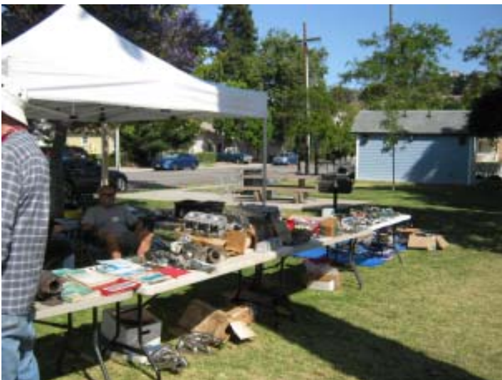
Several vendors showed up this year.