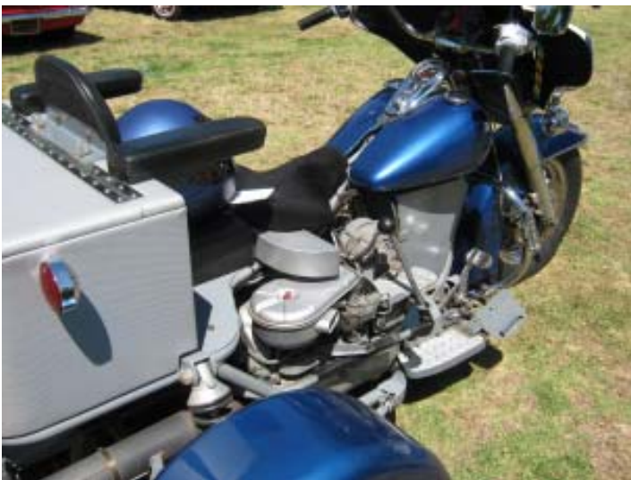
A Corvair powered 3-wheeled cycle