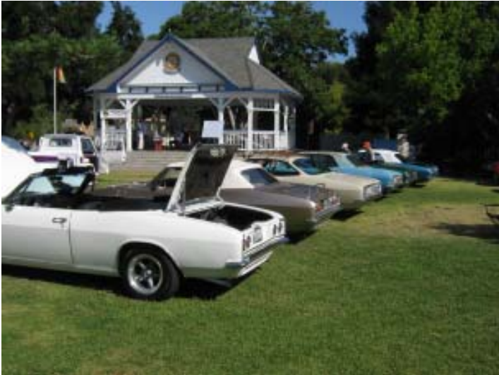
Some very nice Late Model Corvairs