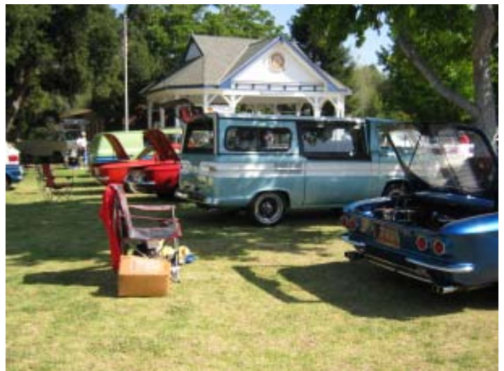
Hal's Rampside next to Vance's '62 coupe.