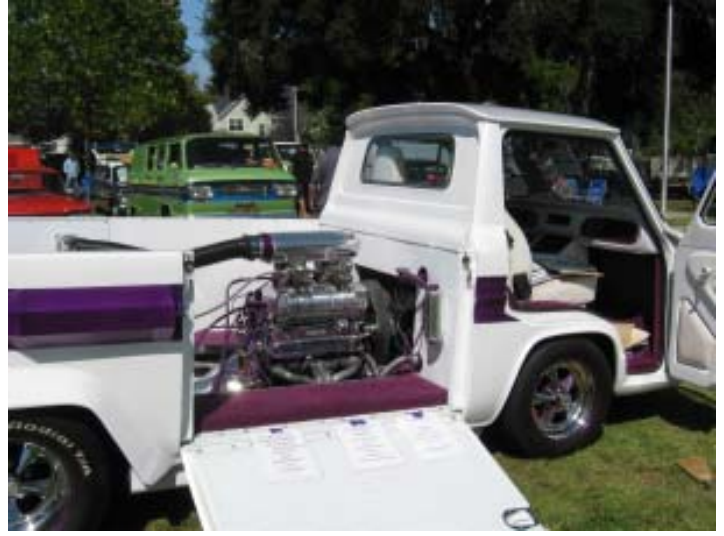
Nate's Rampside with super charged Chrysler V-8.