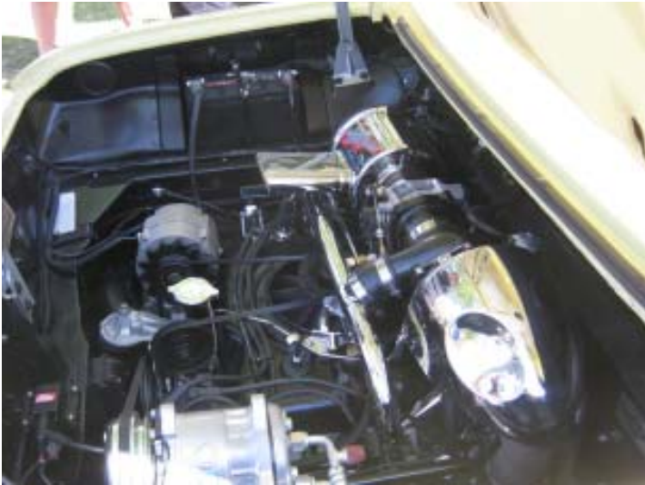
'64 Spyder with custom A/C and fuel injection