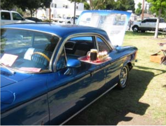
Vance all setup for the drive-in!