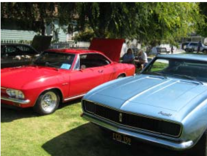
A Camaro next to a Late Model for comparison!