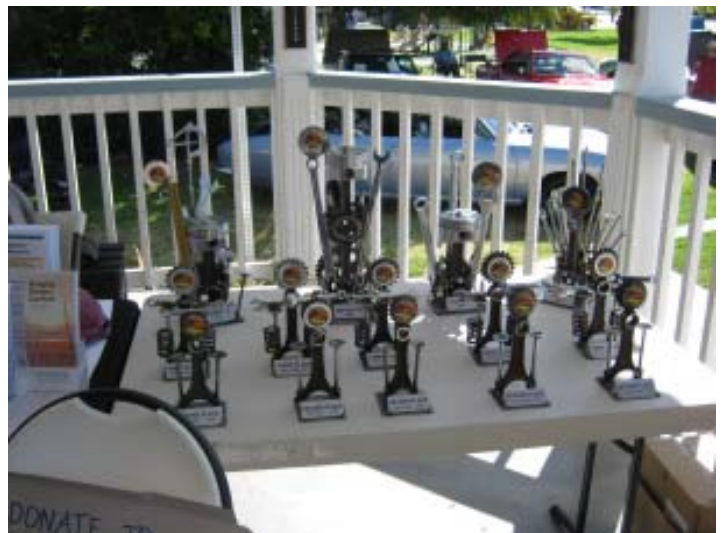
Custom hand-made Trophies on display before being handed out.