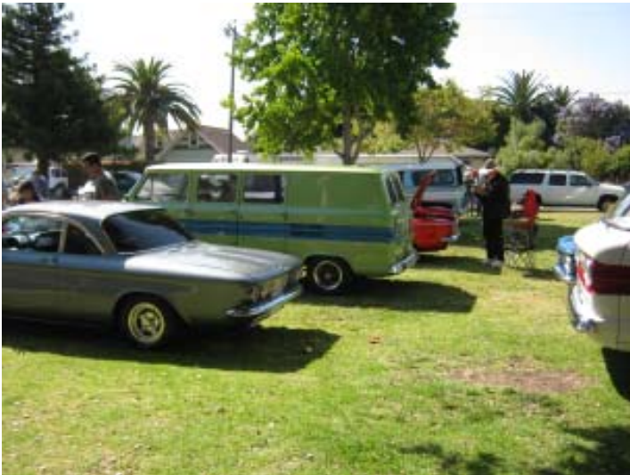
Some Earlies and Forward Controls.