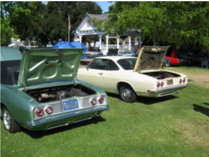
A gorgeous '65 150 hp Corsa Turbo Convertible