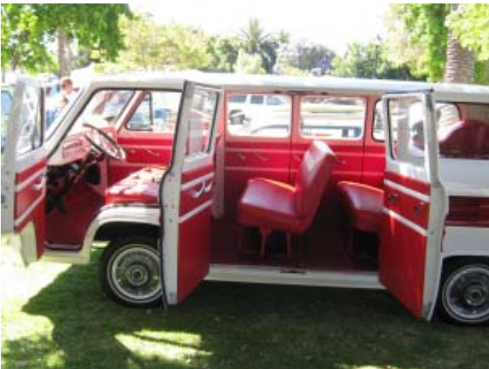
A very nice Greenbriar